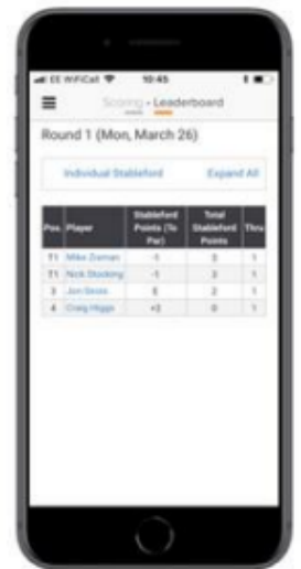
Stay up to date with the live leaderboard whether you're out on the course, or in the bar