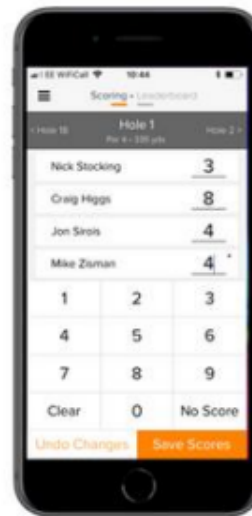
Use the numbers to enter the GROSS scores. Golf Genius will work out your points for you