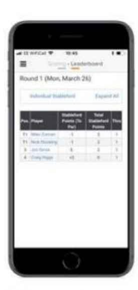
Stay up to date with the live leaderboard whether you're out on the course, or in the bar