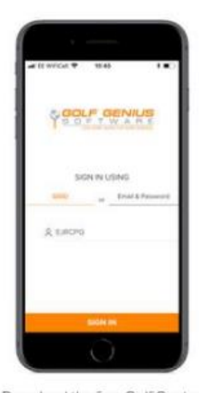
Download the free Golf Genius app from the app store. Log in using your GGID located in the bottom right hand corner of your scorecard