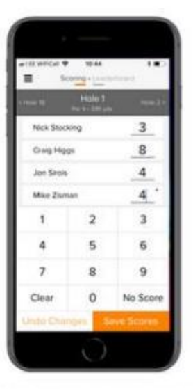
Use the numbers to enter the GROSS scores. Galf Genius will work out your points for you